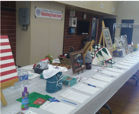
Virtual auction (consider using a video platform like Zoom, Microsoft Teams or Facebook Live)