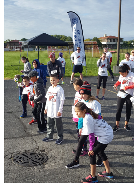
5K race with adults and/or kids getting pledges