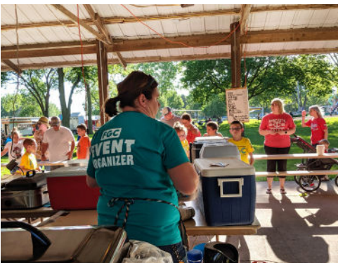
Outdoor games and challenges followed by a simple lunch (such as hot dogs or brats). Consider setting the dollar amount for each food item or asking for a free will offering.