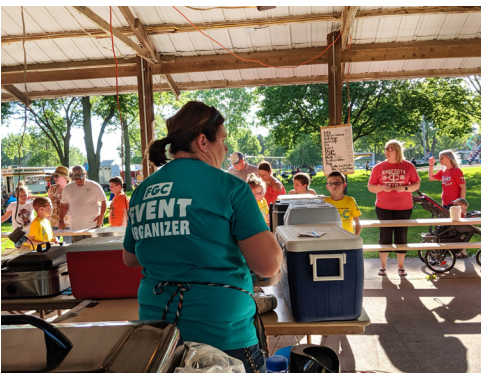
Outdoor games and challenges followed by a simple lunch (such as hot dogs or brats). Consider setting the dollar amount for each food item or asking for a free will offering.