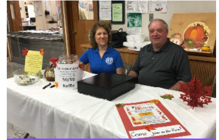
Outdoor pumpkin, gourd or other fall item sale