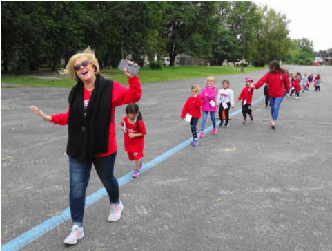
Walk-a-thon, bike-a thon, read-a-thon