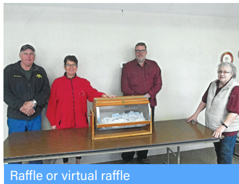
Raffle or virtual raffle