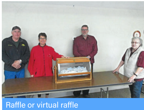
Raffle or virtual raffle