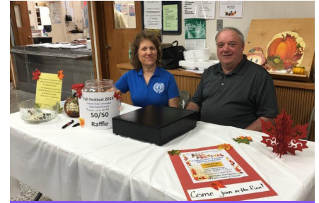
Outdoor pumpkin, gourd or other fall item sale